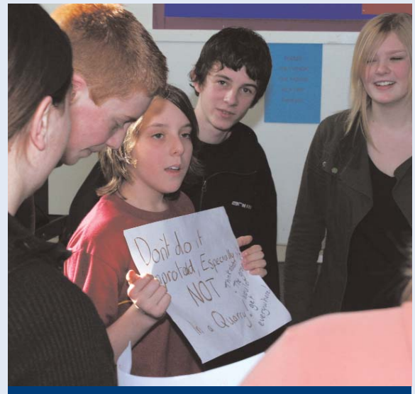
Piloting the project at Anthony Gell School

understanding and food for thought about their futures